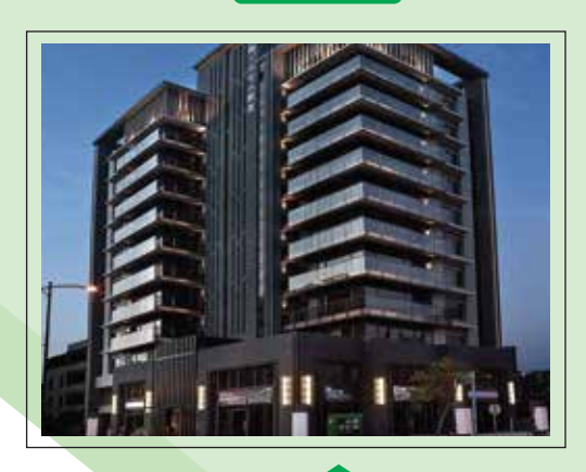
HOTEL & RESORT